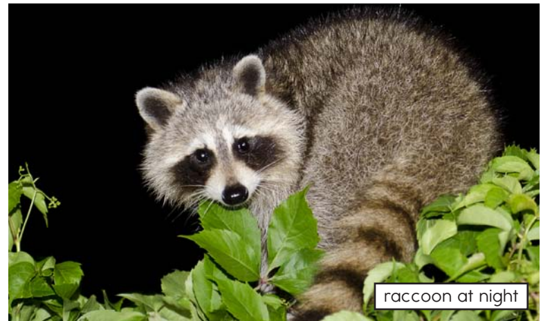
raccoon at night