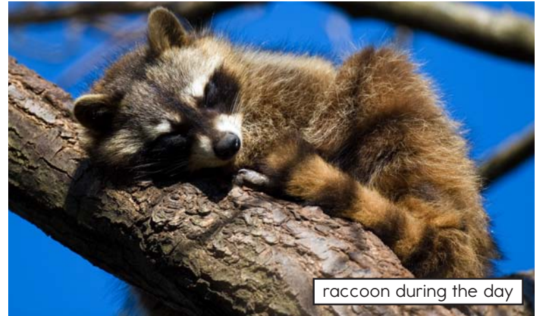
raccoon during the day